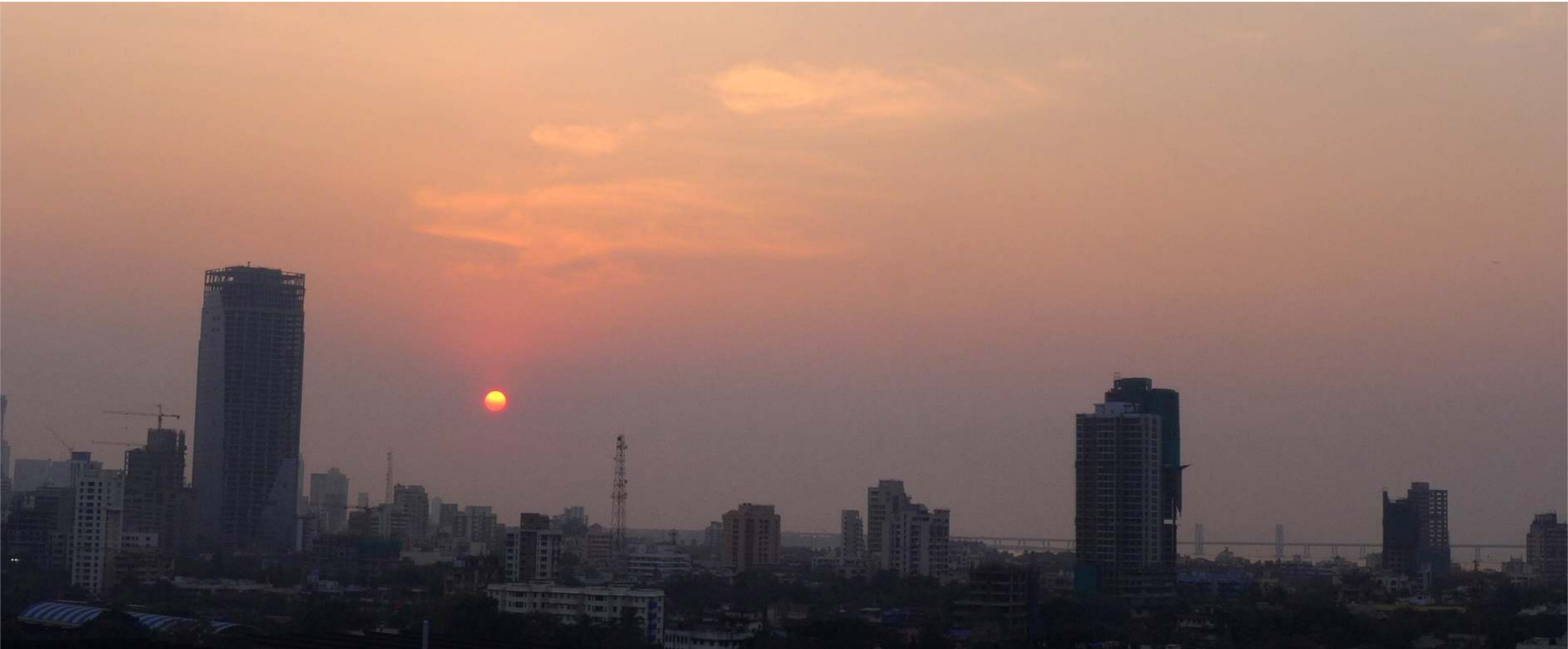
Actual view from the site