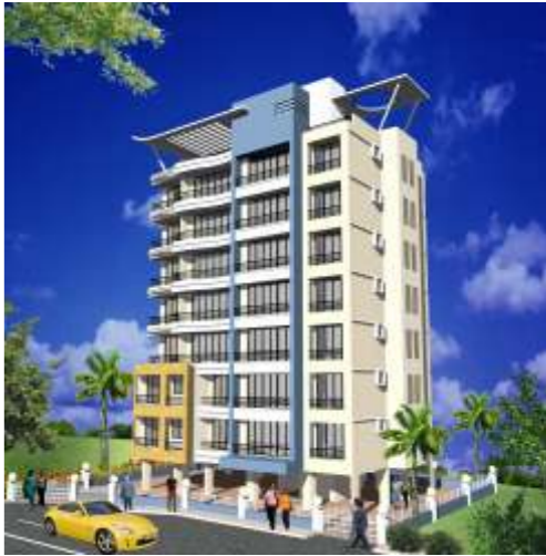
Arham Pitru Chhaya