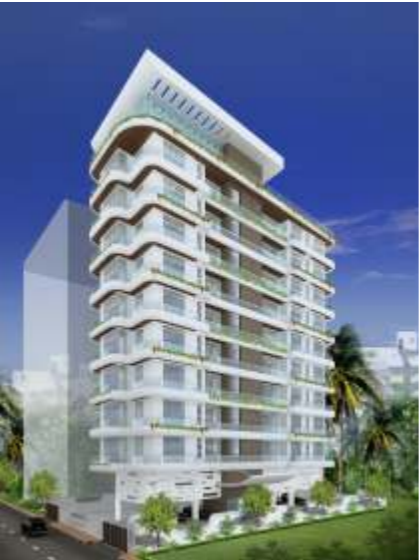
Arham Tulsi Vihar