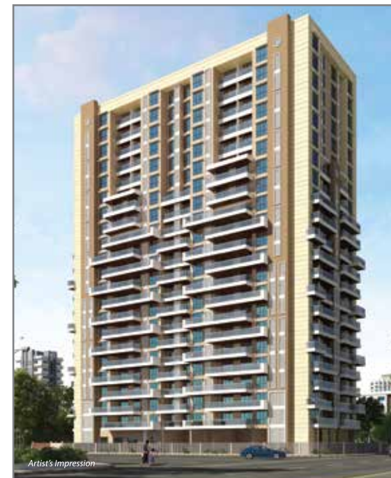
Hubtown Sunstone, Bandra Annexe