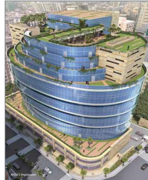
Hubtown Solaris, Andheri East