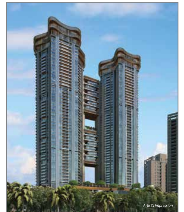
25 South, Prabhadevi