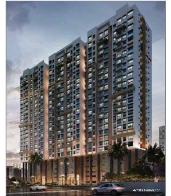
Hubtown Premiere Residences, Andheri West